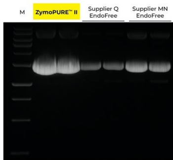
Up to 6x More Concentrated Plasmid